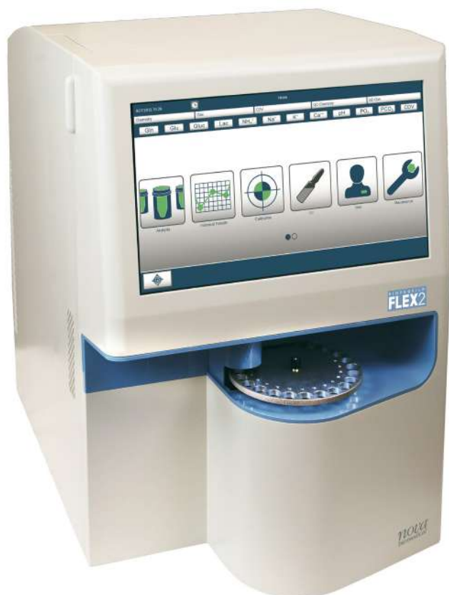
Nova Biomedical BioProfile® FLEX2 and ESM