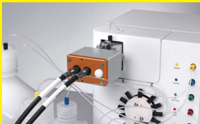
BioPAT® Spectro flow cell with Tornado Spectral Systems probe connected