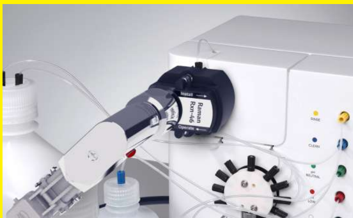
BioPAT® Spectro flow cell with Endress+Houser Optical Analysis, Inc probe connected