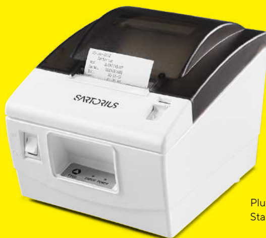
Plug & Play Standard printer YDP40